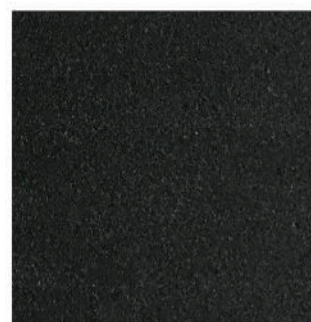
0204 Sable Black

* Additional colours available for custom orders